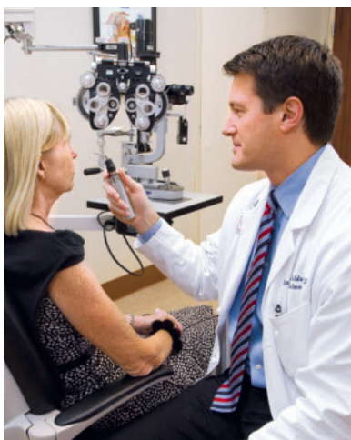
The UCLA Stein Eye Institute is a world-renowned center dedicated to the preservation of vision and the prevention of blindness.