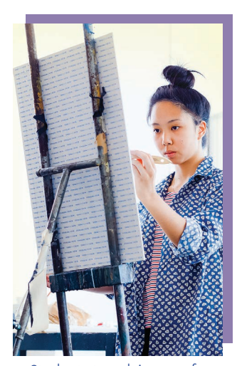
Student at work in one of the many art studios of the UCLA School of the Arts and Architecture.